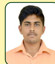
Sree Pathi V C Farming