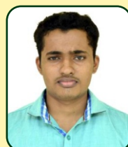
Ajith D Landscape, Tenkasi