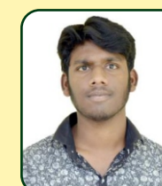
Mohan E Foreign Post, Chennai