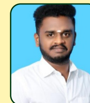
Vignesh B MMB farm and Coirpith Production unit