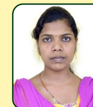
Regitta R L Cake Shop