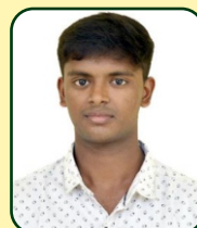
Prabhakaran B Fertilizer Shop