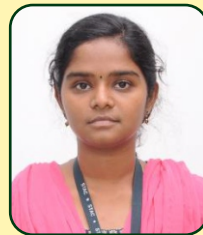
Bakyasurya S AFO, Canara Bank