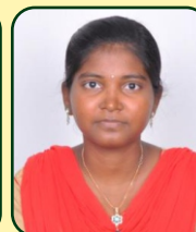
Muthu Prabha M Department of Post