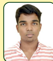
Kedswin K S Export Business, Kerala